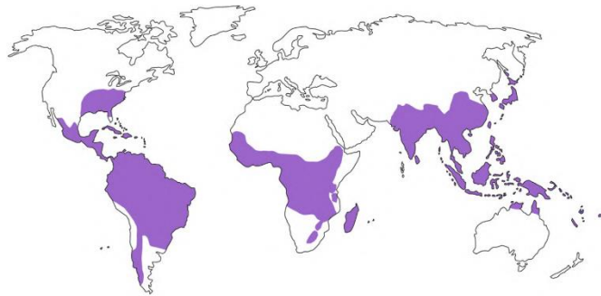
Figure 1: Indicative map of the distribution of bamboo

Source: Kelchner and Bamboo Phylogeny Group, 2013: 406.